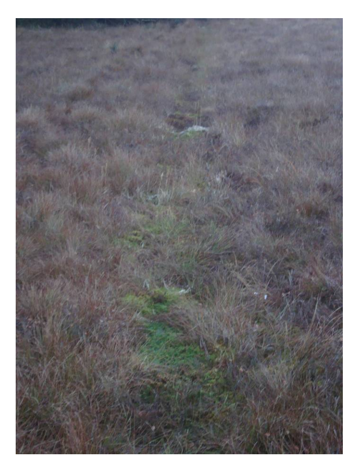
Figure 5. Some of the old drains on the land to the east are only detectable by the patches of bog asphodel growing alongside them.

Figure 4. Open bog on neighbouring land to the east was drained in the past but the drains, filled with Sphagnum, are now ineffective.