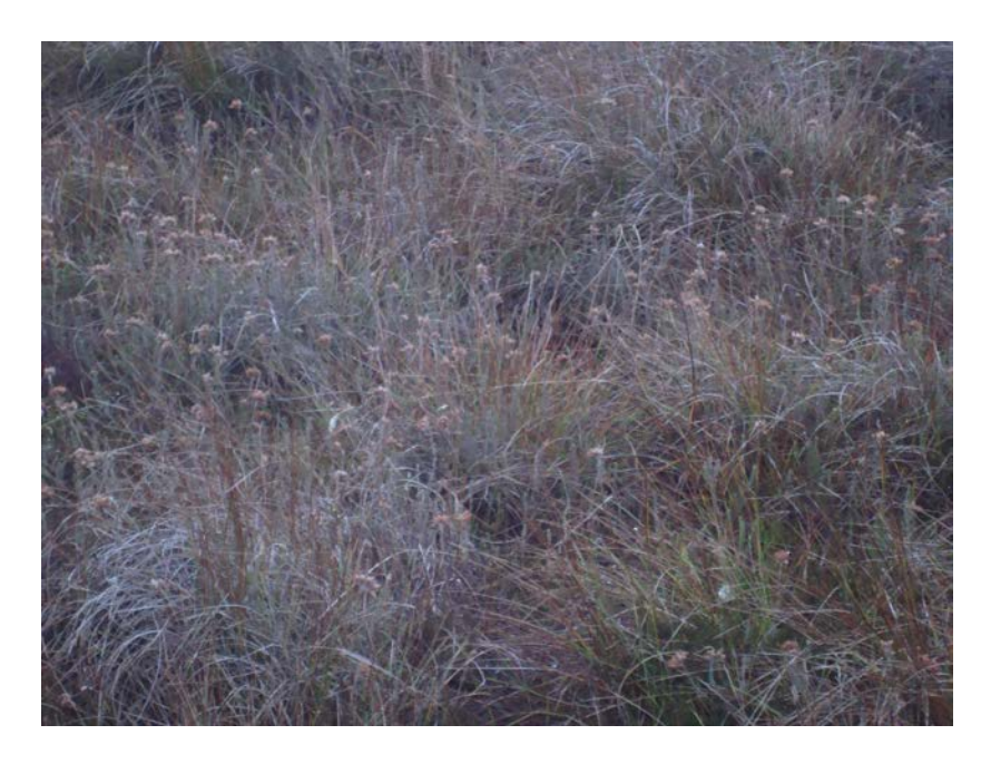
Figure 7.Restored bog on land to the west managed by Leadburn Community<br/>Woodland Group. Photo taken April 2011.

Figure 6. The vegetation on adjacent land to the east is cropped quite short and much of it is dominated by ?? and cross-leaved heath.