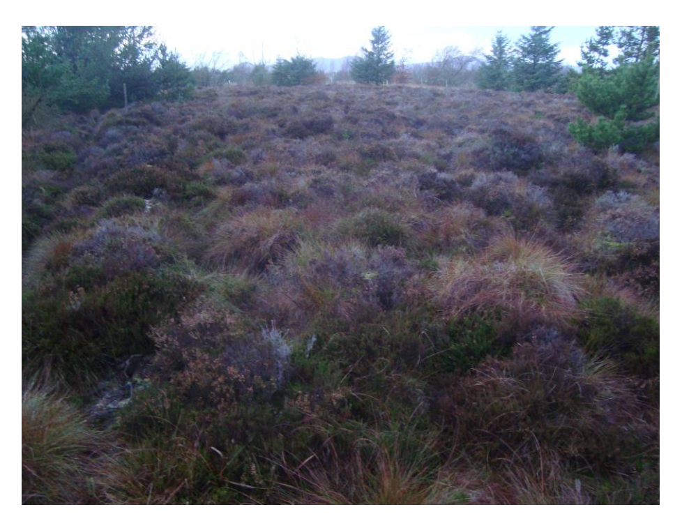
Figure 3. Some of the open ground at the north end of the site is less heather dominated and has a good mixture of bog species, including bog asphodel and magellanic bog-moss Sphagnum magellanicum .

Figure 2. Heather-dominated bog with conifer regen at the north end of the site.