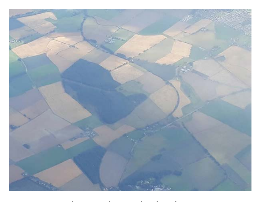
Dronley Wood - An island in the sown.